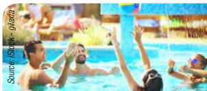
Tourism & Leisure Industry

Weather-adjusted key performance indicators provide you with increased transparency in the pursuit of your corporate goals.