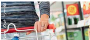
Production & Commerce